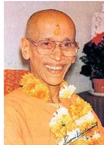
Sri Swami Chidananda